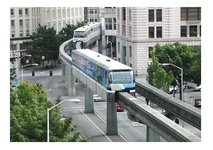
Figure 3.1: Seattle Alweg Monorail, Straddle Monorail (1962).